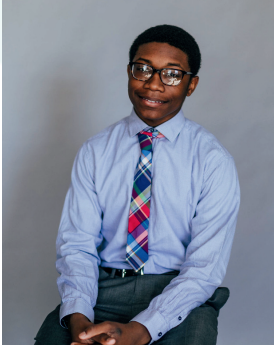
Xavier D. McGuire Youth Centers