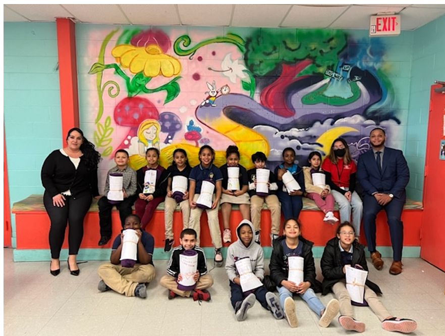
Boys & Girls Club in Garfield, NJ with Blankets of Hope to be Delivered to Center for Hope and Safety, Rochelle Park, NJ.