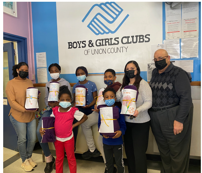
Members of Boys & Girls Clubs of Union County, NJ with their warming Blankets of Hope.