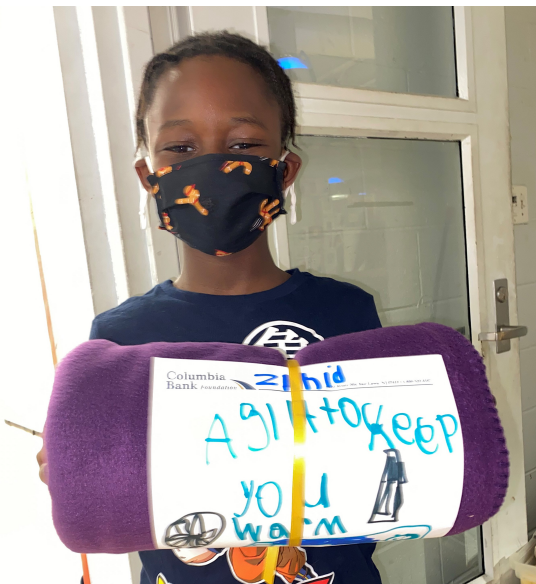
Member of Boys & Girls Clubs of Newark, NJ participates in Blankets of Hope Kindness Workshop.

Purchased by the Columbia Bank Foundation, the blankets were distributed to nine Boys & Girls Clubs in New Jersey chapters, where youths participated in Blankets of Hope's "Kindness Workshop." Children were led through an empathy exercise to imagine what it's like to experience homelessness, then created colorful, handwritten notes of hope, love and encouragement, to pair with each blanket. The heartwarming, inspiring gifts were delivered to local shelters and organizations in need.