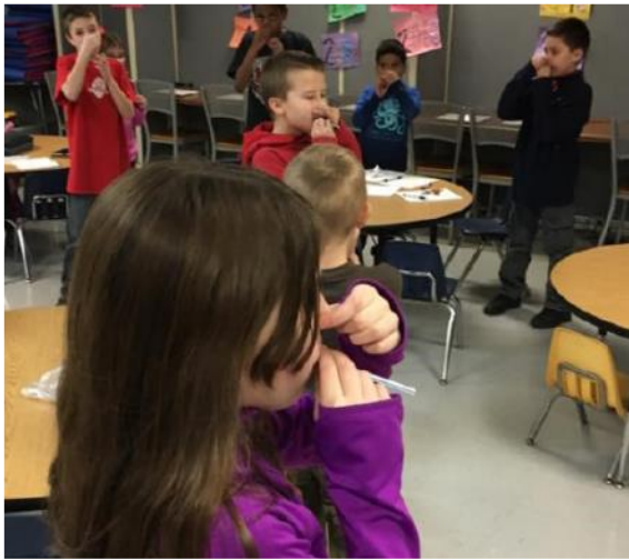
Youth at Boys & Girls Clubs in Northwest NJ participate in a BEAM class using straws to simulate the feeling of breathing during an asthma attack.

In September 2015, Boys & Girls Clubs in New Jersey, with the support of The Horizon Foundation for New Jersey, has expanded the Breathe Easier with Asthma Management (BEAM) program and has launched BEAM Phase II. BGCNJ has engaged 16 Clubs and over 40 sites to serve 2,500 youth in the BEAM program. BEAM will serve youth ages 5-18 years of age to provide both asthma management programming to those youth identified with asthma and asthma awareness to those youth who have not been diagnosed with asthma. For youth diagnosed with asthma, Clubs will utilize the evidence based, Open Airways for Schools Curriculum, developed by the American Lung Association. BGCNJ has worked in tandem with the American Lung Association in New Jersey to enhance and develop the Asthma Awareness Curriculum as an age-appropriate, interactive and engaging awareness curriculum for youth who have not been diagnosed with asthma.