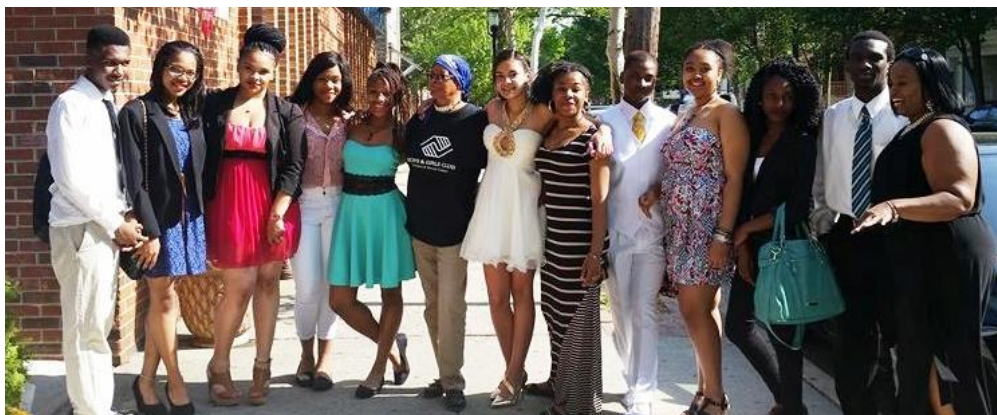
Boys & Girls Clubs of Mercer County teens at the Club's Teen Gala.

The Boys & Girls Clubs of Mercer County has been serving Mercer County youth since 1937. Today the organization provides key programs to 2,600 youth each year out of seven program locations in Mercer County. This past fall, the Club opened a 35,000 square foot community center in Lawrence Township with the goal of doubling the number of youth served by 2020. Before opening the new facility the organization served 1,000 youth per day during the school year, and 550 per day during the summer.