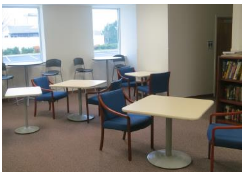
Front entrance and College & Career Center at new Lawrence Township facility.

To expand program offerings, the Club has partnered with a number of community organizations. For example Rutgers 4H of Mercer County, National Junior Tennis and Learning of Trenton, and Bucks County Fencing Academy. A number of other partners enable the Club to offer high level courses in Art, Dance, Gymnastics, TV Production, Karate, robotics, Zumba, and Yoga, among others.