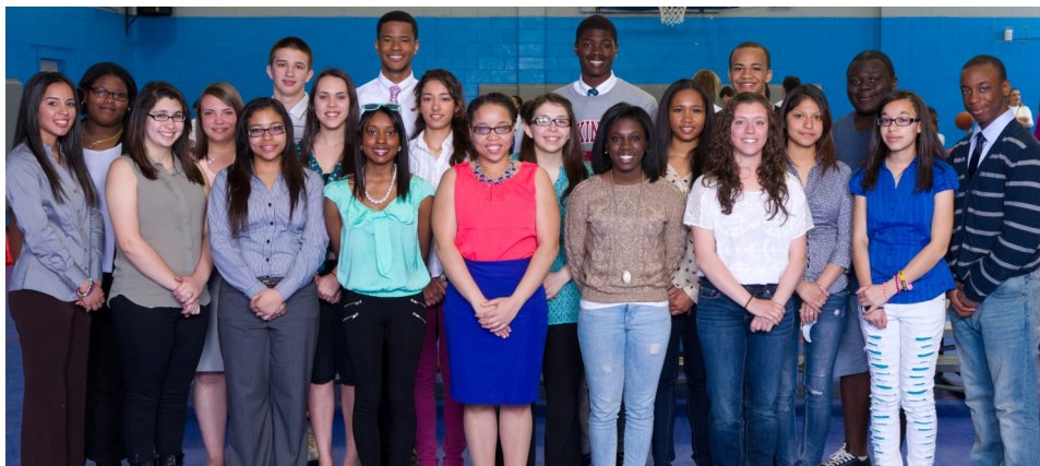
2013 Youth of the Year Finalists