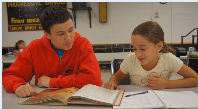
Youth in Wayne participate in individual reading sessions.

From January to June 2013, State Farm provided continued support of the Peer Assisted Learning (PAL) Program which places youth mentors ages 14-18 with youth mentees ages 6-10 for weekly reading sessions in Camden, Clifton, Garfield, Newark, Paterson, Lodi and Wayne. Through the program, 73% of mentees showed improvement in their reading skills based on the Houghton Mifflin Reading assessment.