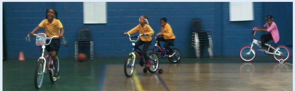
Club youth at Boys & Girls Clubs in Trenton/Mercer get active.

The Horizon Foundation for New Jersey continued their annual $50,000 grant in support of Triple Play, an evidence based health and wellness program. The funds will enable Clubs in Atlantic City, Camden, Newark and Trenton to engage 350 youth from ages 6 to 18 years old in nutrition and fitness activities to combat the growing childhood obesity epidemic. The Triple Play program strives to improve the overall health of youth by addressing the three domains of mind, body and soul. Triple Play educates boys and girls about good nutrition, making physical fitness a daily practice and developing individual strengths and good character.